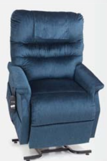
Monarch Plus Large PR-359L