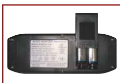
Battery Backup System

Sizes may vary depending on fabric, filling material, upholstery and carpet thickness. All measurements taken on concrete floor using levels and metal rulers.