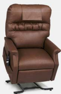
Monarch Large PR-355L