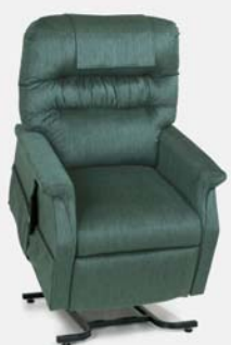
Monarch Medium PR-355M