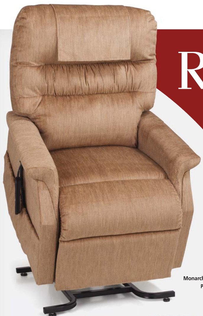
Monarch Plus Medium PR-359M