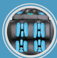
Air Squeeze Technology for the Feet and Calves