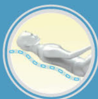
Ergonomic S-Track Mechanism