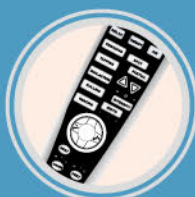
3 Automated Programs at a Push of a Button